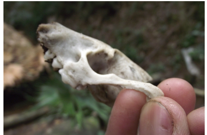
Fig. 2. Incomplete skull of Large-toothed Ferret Badger Melogale personata , Nakai–Nam Theun National Protected Area, central eastern Laos, 28 July 2011.

During a large-scale camera-trap survey in Nakai–Nam Theun NPA from 2006 to 2011, many photographs of Melogale